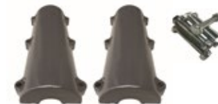
BMF-9235003 Shield Set- 315mm

Replacement cylinder cover set, includes (2) BMF-3201549 shield halves and (1) 9240002 hardware set. Used with BMF-9245992 cylinder.