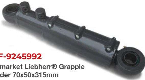
BMF-9245992 Aftermarket Liebherr® Grapple Cylinder 70x50x315mm

High strength and rugged cylinder is rated at 5000psi. 70mm bore x 315mm stroke and 50mm diameter rod. Spherical bearings on cylinder and rod ends. Aftermarket replacement for Liebherr® grapple cylinder 9245992. Fits series 69 & 70 (1.05-1.44 cu yd) grapples.