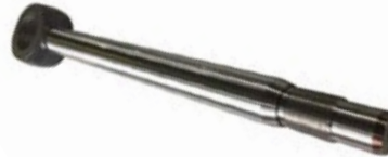
BMF-9063664 Chromed rod 315mm

Includes (1) 7025750 bearing, (2) 4281012 snap rings, (1) 7001228 grease fitting and (1) 4242017 retaining ring. Used on BMF-9245992 cylinder.