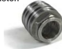
BMF-40117441 80mm Piston

Hardened steel piston. Used on BMF-94040349 cylinder.