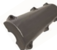
BMF-3201549 Cast Steel Shield 315mm

Painted cast steel shield (half shell), used on BMF-9245992 cylinder. Secured with BMF-9240002 hardware kit.