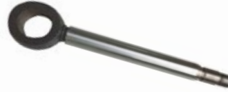
BMF-9063463 Chromed rod 215mm

Solid forged chrome rod, includes (1) 7025750 bearing, (2) 4281012 snap rings, (1) 7001228 grease fitting and (1) 4242017 retaining ring. Used with BMF-9241931 cylinder.