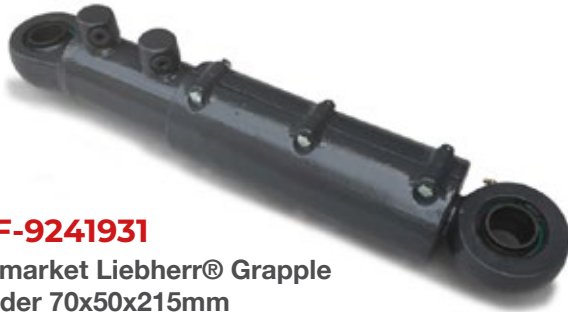
BMF-9241931 Aftermarket Liebherr® Grapple Cylinder 70x50x215mm

High strength and rugged cylinder is rated at 5000psi. 70mm bore x 215mm stroke and 50mm diameter rod. Spherical bearings on cylinder and rod ends. Aftermarket replacement for Liebherr® grapple cylinder 9241931. Fits series 64 & 65 (0.52-0.78 cu yd) grapples.