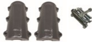
BMF-9200966 Shield Set- 215mm

Replacement cylinder cover set, includes (2) BMF-3201484 shield halves and (1) 9240002 hardware set. Used with BMF-9241931 cylinder.