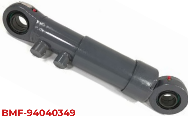
BMF-94040349 Aftermarket Liebherr® Grapple Cylinder 80x56x295mm

High strength and rugged cylinder is rated at 5000psi. 80mm bore x 295mm stroke and 56mm diameter rod. Spherical bearings on cylinder and rod ends. Aftermarket replacement for Liebherr® grapple cylinder 94040349. Fits series 80 grapples.