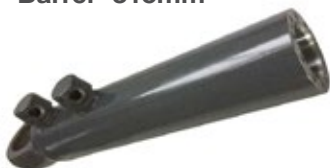
BMF-9063666 Barrel- 315mm

Welded and honed barrel, includes (1) 7025750 bearing, (1) 4281012 snap ring and (1) 7743242 grease fitting. Used with BMF-9245992 cylinder.