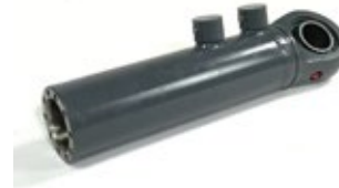
BMF-94016832 Barrel- 295mm

Welded and honed barrel, includes (1) 7003242 bearing, (1) snap ring and (1) 7743242 grease fitting. Used with BMF-94040349 cylinder.