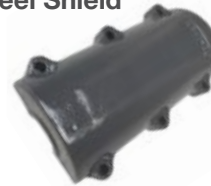
BMF-3201484 Cast Steel Shield 215mm

Painted cast steel shield (half shell), used on BMF-9241931 cylinder. Secured with BMF-9240002 hardware kit.